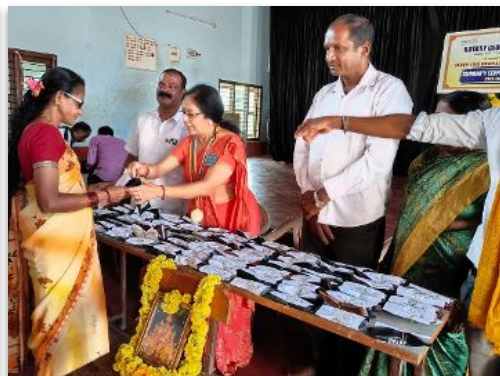
A Free Eye Check-up Camp was organized at Kukkehalli, providing essential eye care services to 164 individuals who underwent eye examinations . Following the check-up, 107 beneficiaries received free spectacles , enabling improved vision.