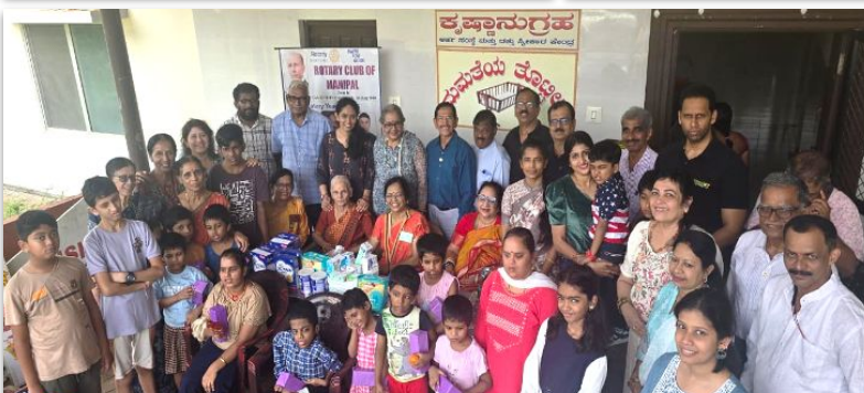
Visited Krishnanugraha, Children's Fit Institute and Child Adoption centre - providing meals and handing over the requirements