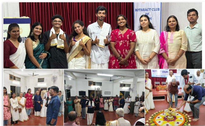
Onam Celebration along with Rotaract