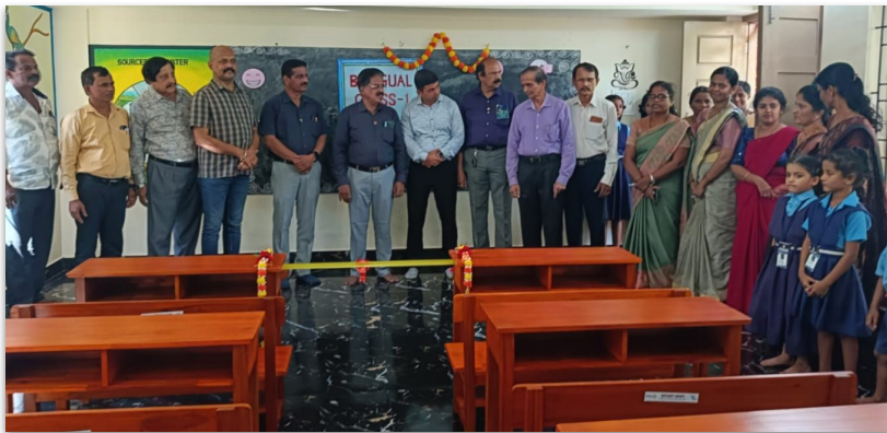
Donated Desk and Benches to Sagrinole School