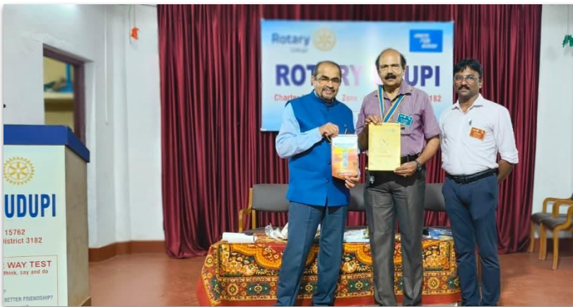
Exchanged flags with Jt Secretary Dist 3191