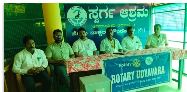
Assisted the underprivileged residents at Swarga Ashrama