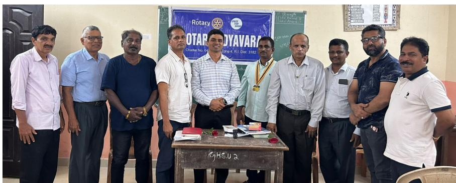
AG conducted Club Assembly prior to DG's Official Visit