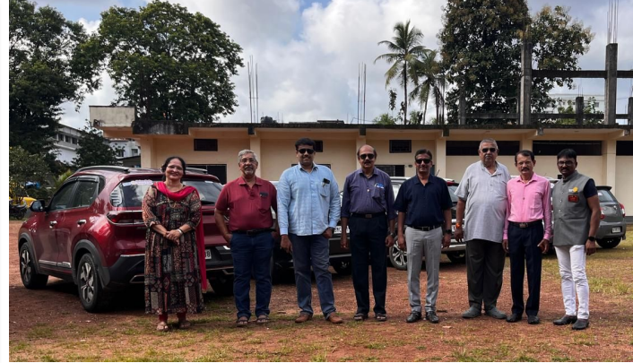
Conducted Road Safety program by distributing Road Safety Stickers