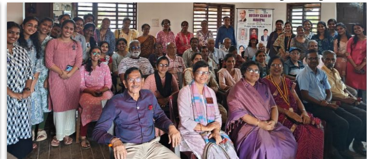
On the occasion of World Alzheimer's day and the following older citizen's day, Caregivers day out was arranged, in Association with MCHP, MAHE, Manipal. A total of 60 benefited from this initiatives.