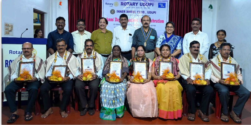
Celebrated Anns day and Teachers day programme 03 Sep 2025