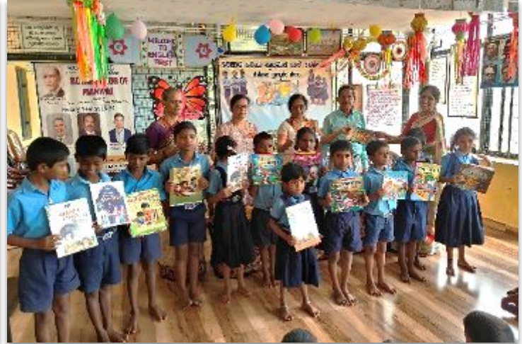
Distributed of bilingual story books and biographies of great personalities with pictures to 300 primary school children on the occasion of World Literacy Day